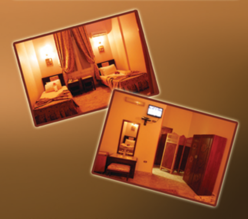
City View Hotel offers spacious guest rooms. All of them fully equipped with private balconies.